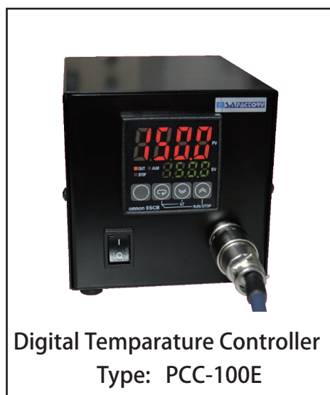
Digital Temperature Controller Type: PCC-100E

Chemical / Research and development for Material Ceramic/ Metal/ Inorganic